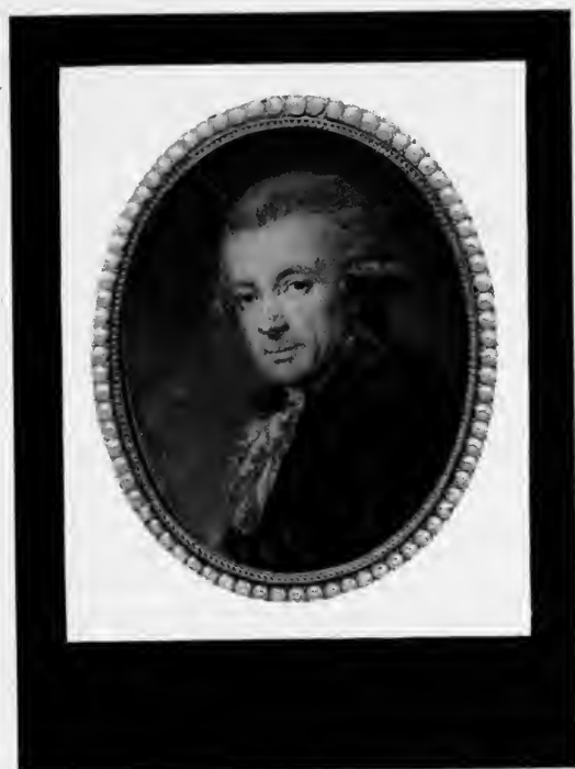
PORTRAIT OF THE ARTIST BY GIOVANNI BATTISTA DE LAMPI